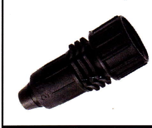
Female Hose Beginning w/Swivel

Use to attach mainline tubing to a faucet, hose or the male hose threads of a filter or adapter. The most common way to start a system.